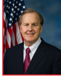
Rep. Robert Pittenger (R-NC-09)