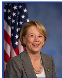
Rep. Niki Tsongas D-MA-03