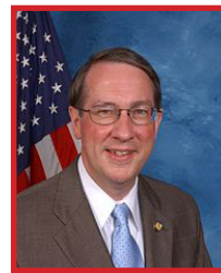
Rep. Bob Goodlatte (R-VA-06)