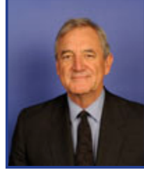
Rep. Richard Nolan (D-MN-08)