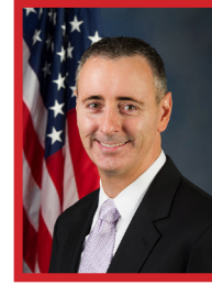
Rep. Brian Fitzpatrick (R-PA-08)