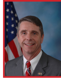
Rep. Rob Wittman (R-VA-01)