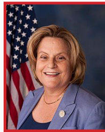
Rep. Illeana Ros-Lehtinen (R-FL-27)