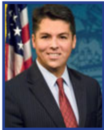
Rep. Brendan Boyle (D-PA-13)