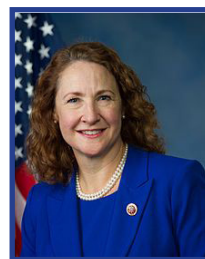
Rep. Elizabeth Esty (D-CT-05)