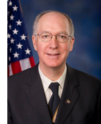
Rep. Bill Foster (D-IL-11)