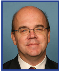
Rep. Jim P. McGovern(D-MA-02)