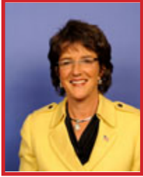
Rep. Jackie Walorski (R-IN-02)