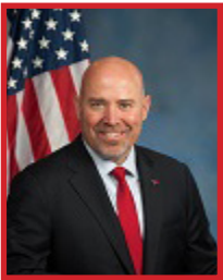
Rep. Thomas MacArthur (R-NJ-03)