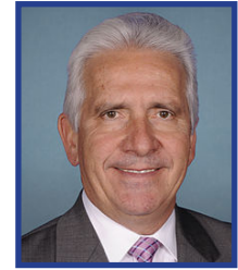
Rep. Jim Costa (D-CA-16)