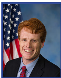
Rep. Joseph Kennedy III (D-MA-04)