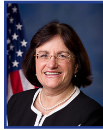
Rep. Ann McLane Kuster (D-NH-02)