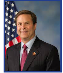
Rep. Donald Norcross (D-NJ-1)