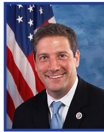
Rep. Tim Ryan (D-OH-13)