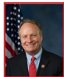
Rep. Dave P. Joyce (R-OH-14)