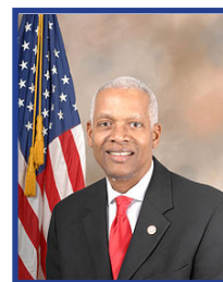
Rep. Hank Johnson (D-GA-04)