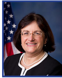
Rep. Ann McLane Kuster (D-NH-02)