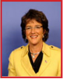
Rep. Jackie Walorski (R-IN-02)