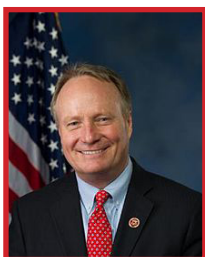
Rep. Dave P. Joyce (R-OH-14)