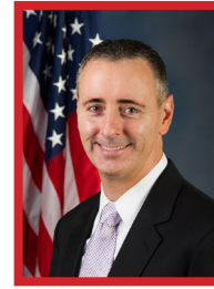
Rep. Brian Fitzpatrick (R-PA-08)