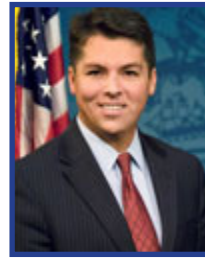
Rep. Brendan Boyle (D-PA-13)