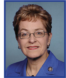
Rep. Marcy Kaptur (D-OH-09)