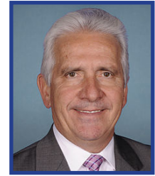
Rep. Jim Costa (D-CA-16)