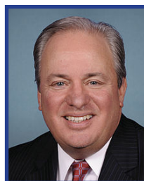
Rep. Mike Doyle (D-PA-14)