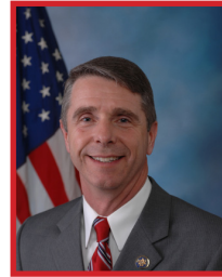
Rep. Rob Wittman (R-VA-01)