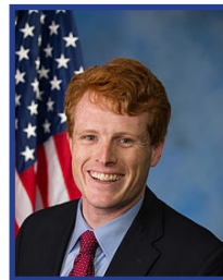
Rep. Joseph Kennedy III (D-MA-04)