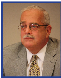
Rep. Gerald Connolly (D-VA-11)