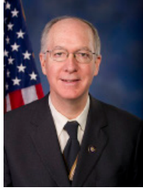
Rep. Bill Foster (D-IL-11)