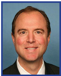
Rep. Adam Schiff (D-CA-28)