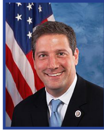
Rep. Tim Ryan (D-OH-13)