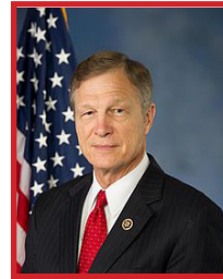
Rep. Brian Babin (R-TX-36)