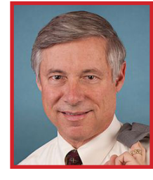
Rep. Fred Upton (R-MI-6)