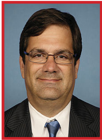
Rep. Gus Bilirakis (R-FL-12)