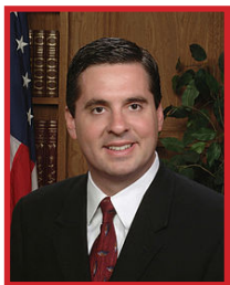
Rep. Devin Nunes (R-CA-22)