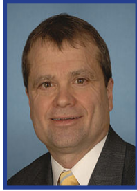
Rep. Mike Quigley (D-IL -5)