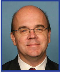
Rep. Jim P. McGovern(D-MA-02)