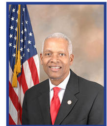
Rep. Hank Johnson (D-GA-04)