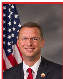
Rep. Doug A. Collins (R-GA-09)