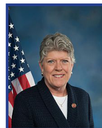
Rep. Julia Brownley (D-CA-26)