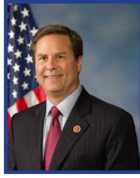
Rep. Donald Norcross (D-NJ-1)